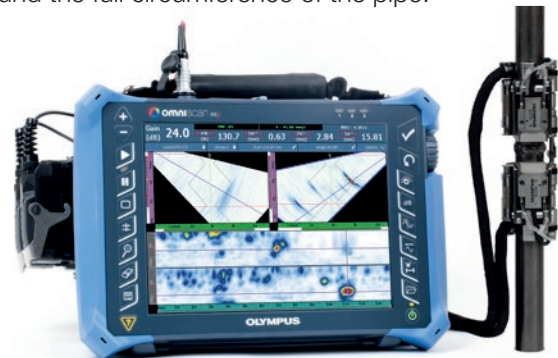
The COBRA scanner on a 0.84 in. pipe with two A15 PA probes, Y-adaptor splitter, and an OmniScan MX2 16:64 displaying two PA groups.

This Olympus solution uses low-profile phased array probes with optimized elevation focusing, which enhances detection of small defects in thin-wall pipes. Specially designed low-profile wedges fitting each pipe diameter covered by the scanner are also available for a complete solution. The COBRA scanner ensures stable, constant, and strong pressure, thus providing good UT signals and precise encoding around the full circumference of the pipe.